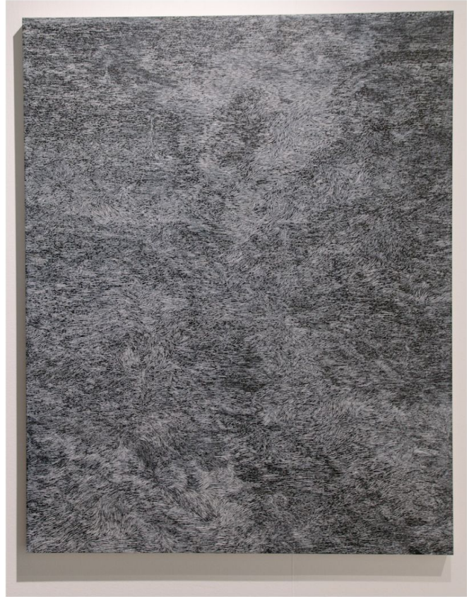
Left: Jeffrey Mitchell. Snowflake Drawing #5 (Double Lotus Pod) , 2018 graphite, ink, carbon transfer and watercolor on paper. Right: Mary Ann Peters. this trembling turf (the shallows) , 2018. White ink on black clayboard.

The two-year acquisition partnership was established in 2018 with a $25,000 gift from the Seattle Art Fair to the Frye Art Museum to support the launch of the Contemporary Council , an affiliate group dedicated to expanding the museum's contemporary art holdings and fostering a new generation of art collectors in Seattle. A second gift of $25,000 was provided for the 2019 edition of the fair, culminating in a total of $50,000 for the museum to expand its permanent collection.