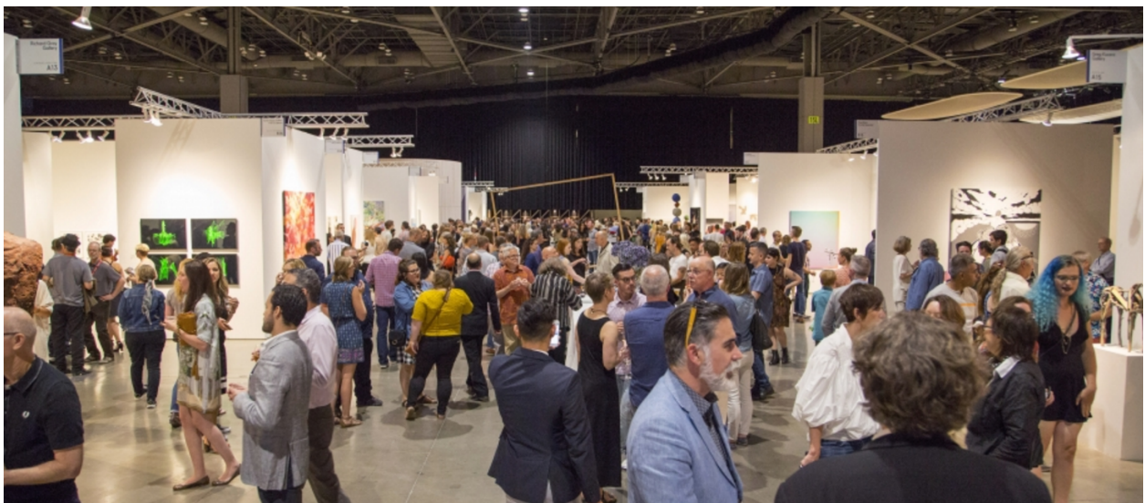
Seattle Art Fair 2016.

Seattle Art Fair Announces 2017 Exhibitor List and Beneficiaries — The third edition of the fair will support Coyote Central and Arts Corps —